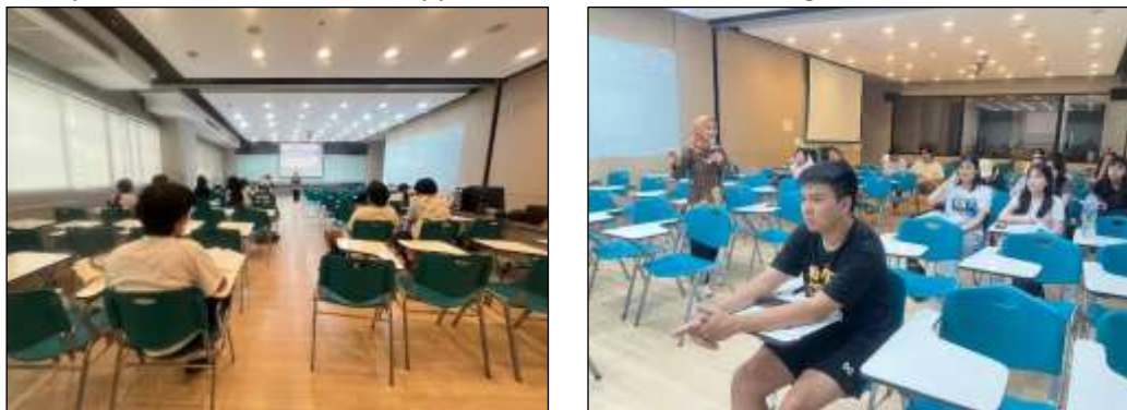
Figure 1. Indonesian culinary introduction session with Thai students

The implementation stage consisted of an interactive presentation introducing Indonesian culinary diversity. The facilitator explained the origins, ingredients, preparation processes, and cultural meanings of selected traditional snacks. Visual materials such as images and short explanations were used to support students' understanding.