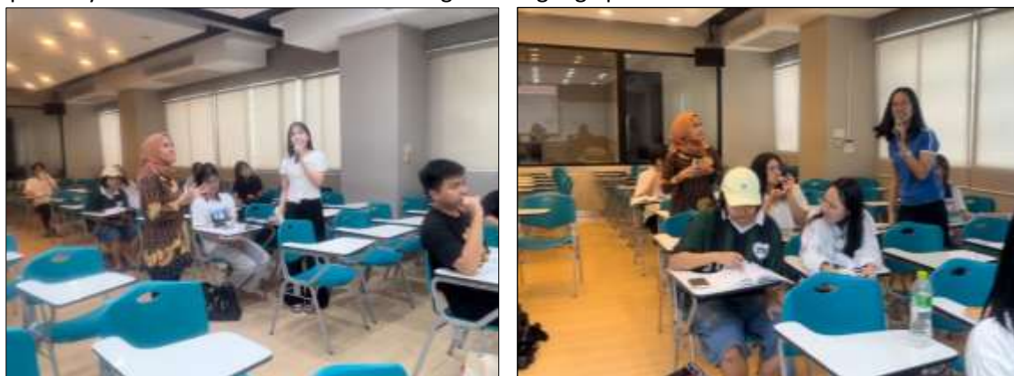
Figure 5. Feedback from participants regarding their understanding, interest, and satisfaction with the culinary diplomacy activity.

The collected data were analyzed descriptively to assess the effectiveness of culinary diplomacy as a medium for cultural learning and language practice.