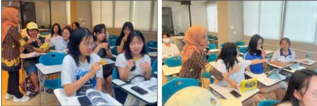
Figure 2. Students experienced Indonesian snack foods directly

In this stage, participants were invited to observe and taste Indonesian traditional snacks including brem , banana sale , rengginang , and tempe chips that were brought directly from Indonesia. The facilitator explained the ingredients, preparation methods, and cultural significance of each snack while participants experienced the taste, aroma, and texture of the food.