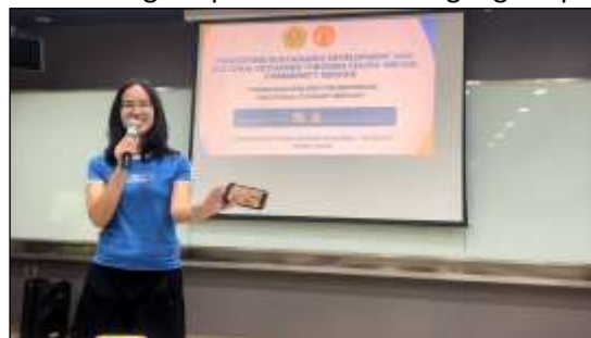
Figure 3. Thammasat University students introducing traditional Thai food

The cultural exchange stage involved two-way interaction between Indonesian facilitators and Thai students. After tasting Indonesian snacks, students were encouraged to describe their sensory experiences using simple Indonesian language expressions.